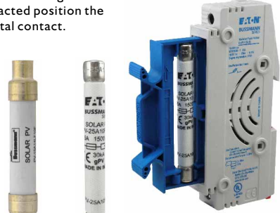
CHPV15L85 with fuse fitted