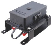
Assembled with Shallow Cover (Suits Fuses Only)