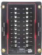
Front View Dual Fuse Rows