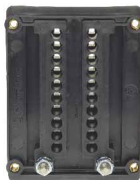
Rear View Dual Busbar Studs