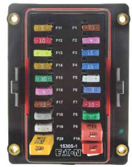
20 x Mini Fuses or Mini Circuit Breakers (Deep Cover Req'd)