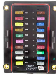
20 x Mini Fuses (Shallow Cover Req'd)

This new I5305 series RTMR has new refinements but remains backward compatible and interchangeable with the original I5303 series RTMR.