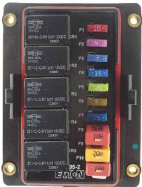
5 x Micro 280 Relays 10 x Fuses / Breakers

This weatherproof 5 x Micro Relays & 10 x Mini Fuse / Circuit Breaker module is designed to provide fuse protected power and relay switching. Relays and fuses can be wired together or independently of each other. All fuses are powered by a single power input stud. A secondary input stud connects all relay coil pins (86) to either Negative or Positive power via an internal buss.