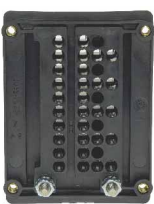
Rear View Dual Busbar Studs