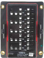
Front View Relay & Fuse Rows

Notes: Module includes cover and input stud caps only. Fuses, circuit breakers, relays, terminals, seals, cavity plugs and bracket are not included. Please refer to page 133 for dimensions and accessory parts.