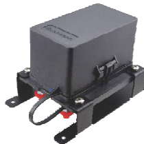
Assembled with Deep Cover (Suits Fuses, Breakers & Relays)

Scan this QR Code for more information on module only.