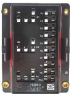
Front View Relay & Fuse Rows

Notes: Module includes cover and input stud caps only. Fuses, circuit breakers, relays, terminals, seals, cavity plugs and bracket are not included. Please refer for page I33 for dimensions and accessory parts.