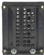
Rear View Dual Busbar Studs