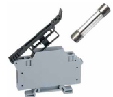
Fused Terminal Blocks (see p.146)