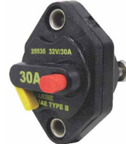
Manual Reset Push To Trip - Button (255 series)