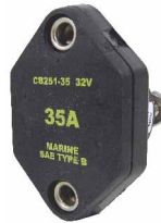
Auto Reset No Button (25 I series)