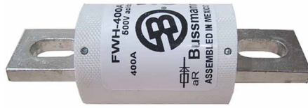
Diagram 1 (35A - 1200A)