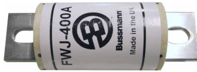
Bolted Tag Type FWJ.. (35A to 2000A)