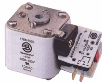
Accessory Microswitch Type K (Page I48)