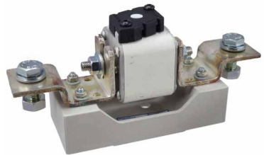
Fuse base with fuse fitted. #B301232