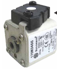
Trigger Indicator & Microswitch Adapter