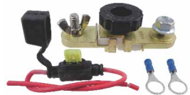
BMS-2 Kit (Suit Side Post)

Refer to pages 2 & 3 for installation instructions