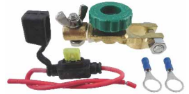
BMS-1 Kit (Suit Top Post)

Notes: Suitable for boats. Recommended by inboard and outboard motor manufacturers using DFI/FFI/EFI electronic fuel injection systems, but use without fuse and holder.