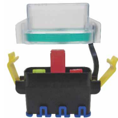
Fuses Not Included