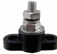
JB51618-2 5/16"-18 Stud