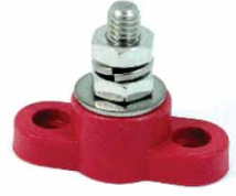
JB51618-3 5/16"-18 Stud