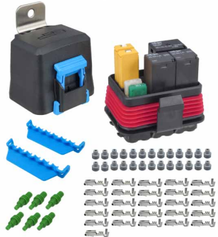
PDMKIT424 - PDM & Terminal Kit