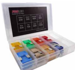
Fuse Kit (see p.39)