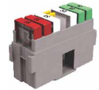
Power Distribution (see p.112 & 138)