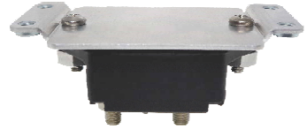
19A-P21-N-xxx Series Automatic Reset T1