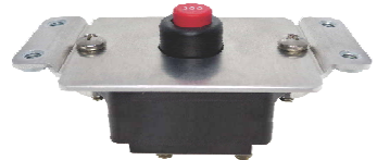
19M-P21-B-xxx Series Manual Reset TIII