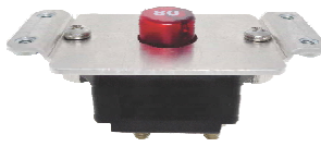
19A-P21-R-xxx Series Automatic Reset T1 With LED TripID™ Feature