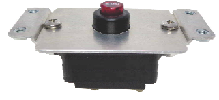
19M-P21-R-xxx Series Manual Reset TIII With LED TripID™ Feature