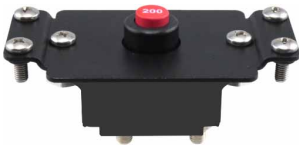
19M-P21-B-xxxB Series Manual Reset TIII With Black Bracket