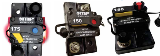
Breaker with tripID Recessed Button Button Guard